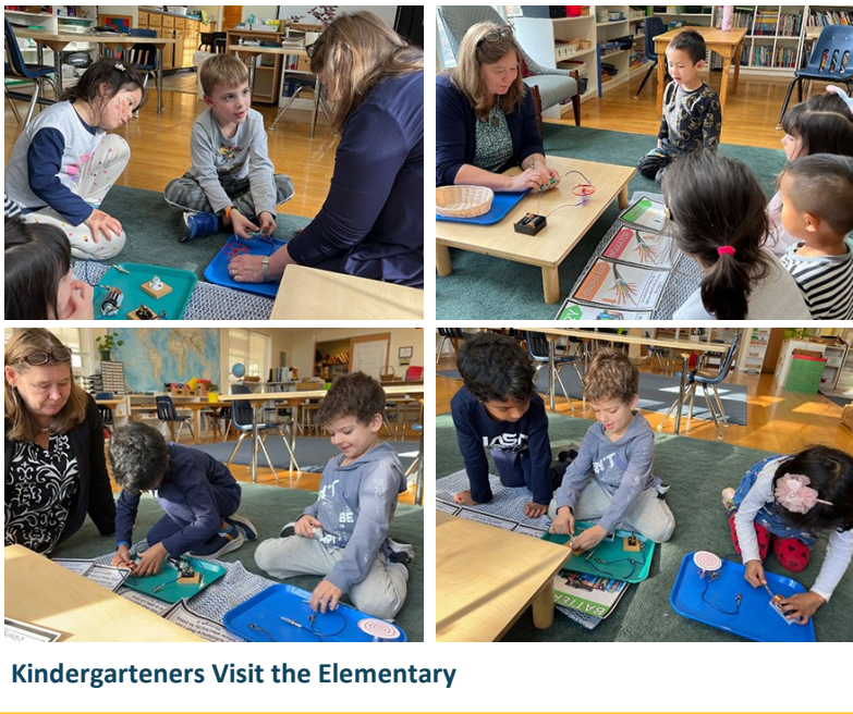
Kindergarteners Visit the Elementary